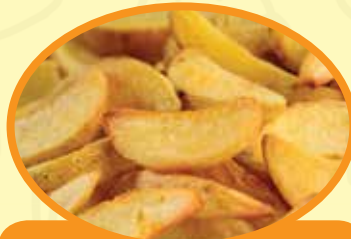
Skin-On Potato Wedges