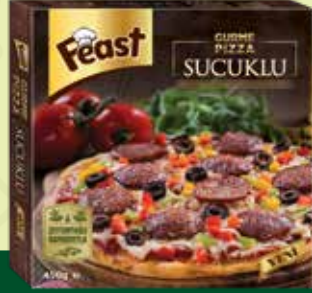
Gourmet Pizza With Soudjouk