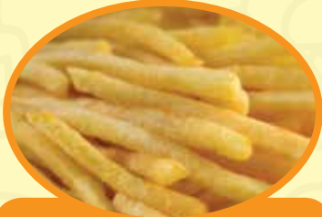
Finger Potato 7 x 7 mm