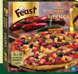
Gourmet Pizza Mexican