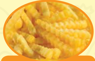
Crinkle Finger Potato 10 x 10 mm