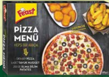
Feast Pizza Menu