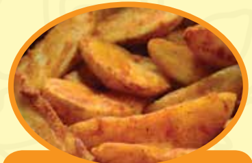
Coated Potato Wedges