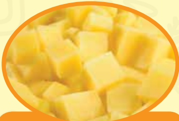
Diced Potatoes 10 x 10 / 15 x 15 / 20 x 20 mm