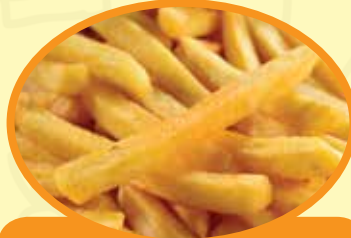
Finger Potato 10 x 10 / 11 x 11 / 12 x 12 mm