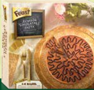
Chocolate Dream Cake

NO NEED TO BE A CHEF Patisserie FOR A GOOD CAKE