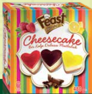
Mini Hearts Cheesecake